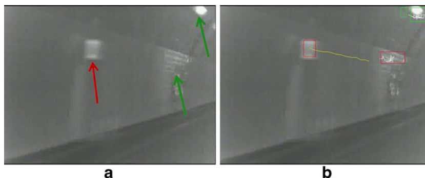
Fig. 1 Original data and detection results. In (a), the red arrow points to the target object: emergency telephone indicator, and the green arrows point to noisy objects. In (b), red rectangles mark detection hypotheses labeled as positive using appearance information, and

Most modern detection methods fall into two categories. Some [5, 8, 10, 14, 19, 25, 27, 32] follow the sliding-window schema, and they detect objects by considering whether each of the sub-images contains an instance of the target object. Classifiers are usually employed by these methods. The other methods [1, 7, 9, 16, 20–22] infer object