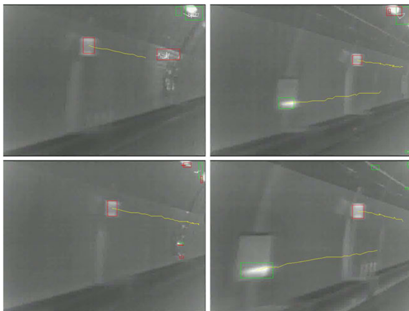
Fig. 5 Detection results

To set intensity thresholds for keypoint detection, Gaussian distribution is assumed for the points belonging to emergency telephone indicators. Following the 3\sigma principle, I_x^{th1} is set to 160 and I_x^{th2} to 190. The approximate sub-images of the emergency telephone indicators are manually marked, and used for training the mixture model of keypoint verification. The detected keypoints falling into